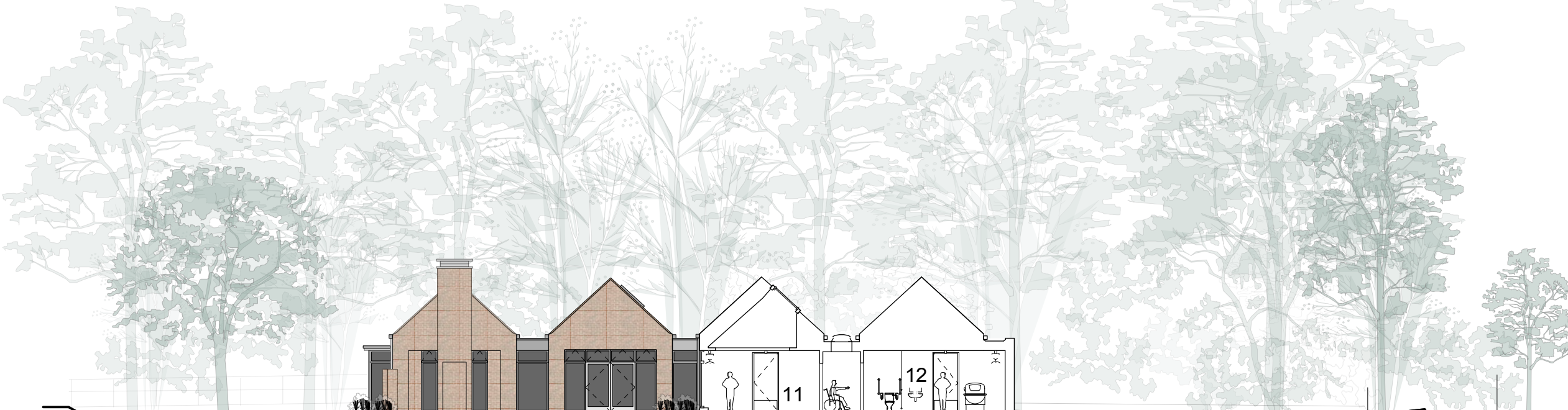
Proposed South Elevation and Section through Bedroom and Bathroom